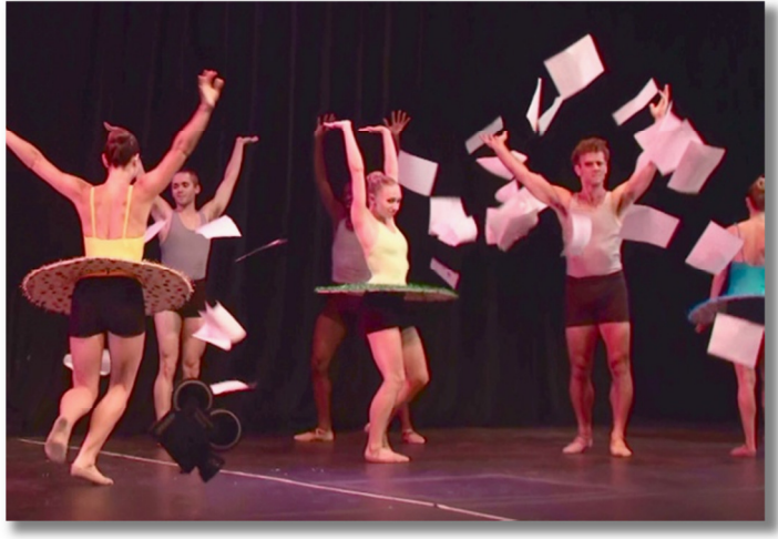
Verb Ballets in the AZooNY "Nuts" production the technological demands on the production staff to a minimal, but it does require a technological awareness not usually employed in traditional theater".

A love for science and the arts combined with a good dosing of comical wit has fostered the creation of his Mars Opera Musical. "I've got it all in my Mars Opera: dance, science, social media, symphonic and rock-n-roll music, space aliens, and all in a light-hearted and comical presentation."